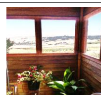
Interior – Side