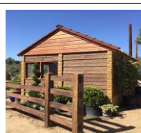
Exterior – Side