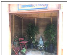
Interior – Front